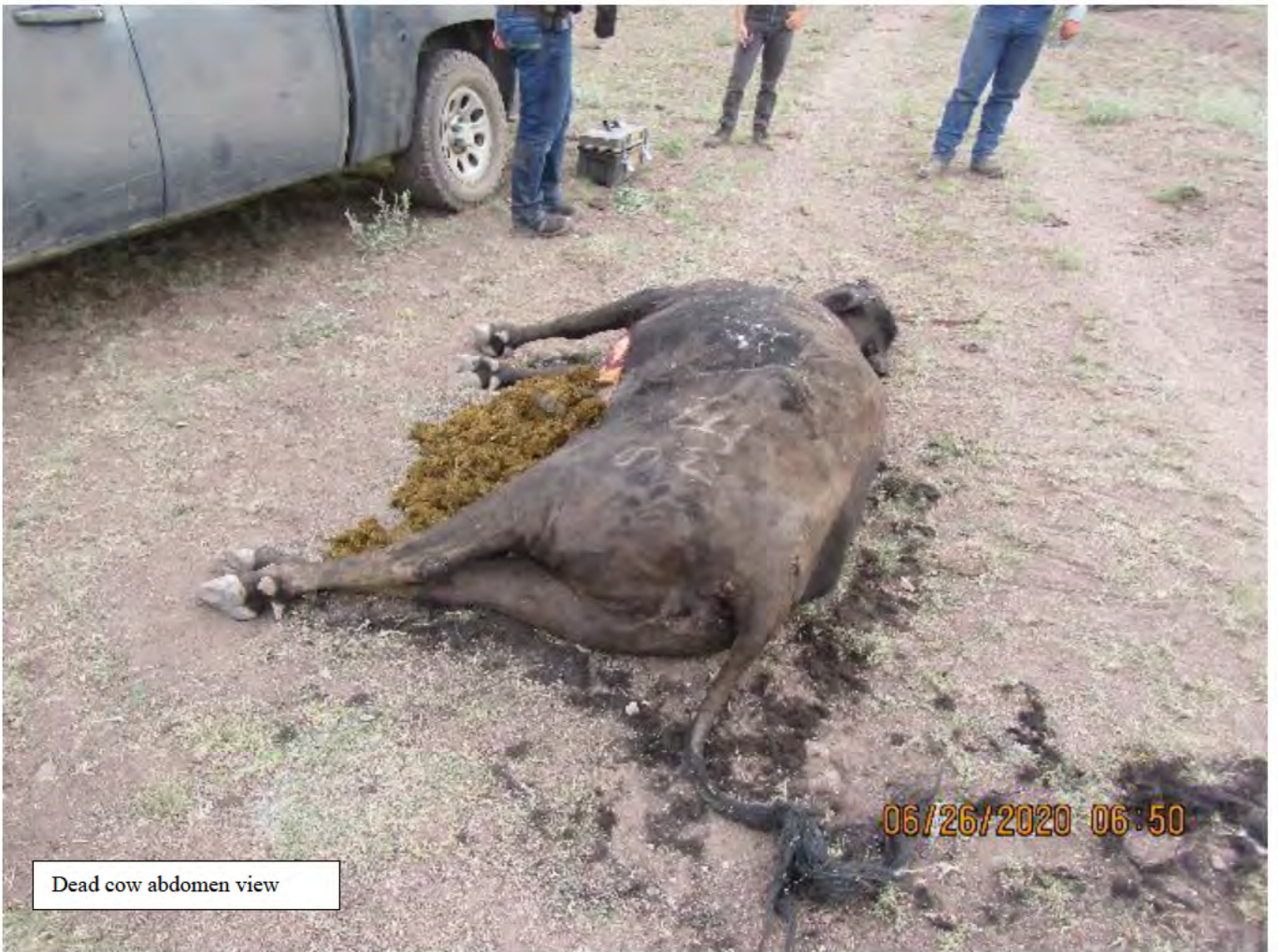
Dead cow abdomen view