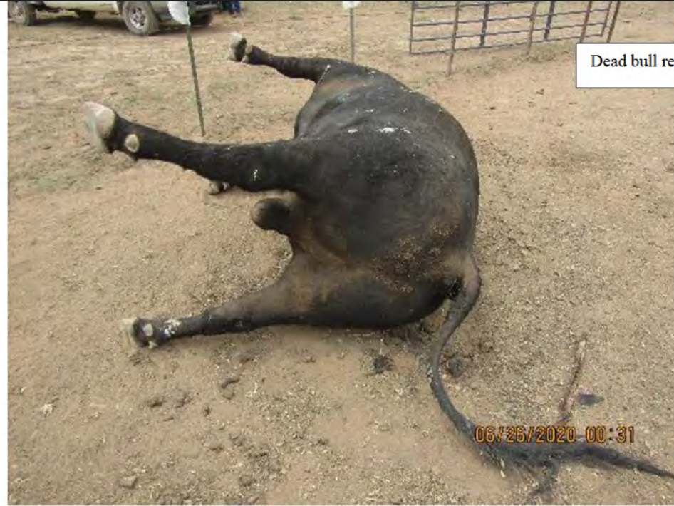
Dead bull rear view