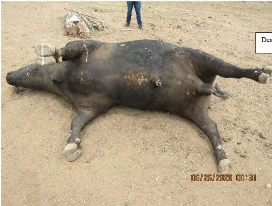
Dead bull belly view