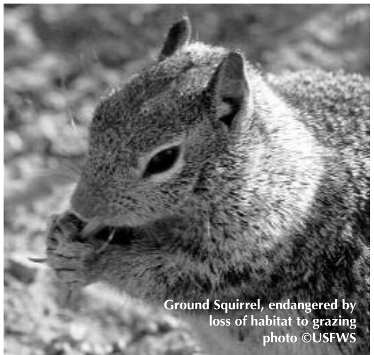
Ground Squirrel, endangered by loss of habitat to grazing

Placing species on the candidate list rather than the endangered list has long been a tactic used by various federal administrations to delay protection of species. To date, the Bush Administration has only protected 31 plants, animals and fish compared with 394 species protected during the first term of the Clinton Administration.