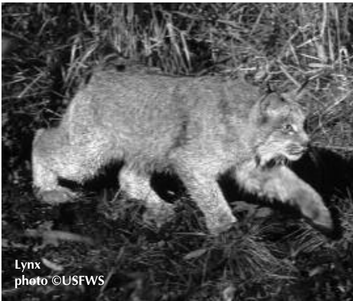
Lynx photo

We just completed our analysis and review of the Caribou National Forest Draft Environmental Impact Statement for grazing livestock in the Bear River Range in southeastern Idaho. The Bear River Range is critical for Canada lynx and wolf migration, containing numerous sensitive species such as flammulated owls, boreal owls, great gray owls, northern goshawks and wolverines. Numerous timber harvests have fragmented habitat, increased road density to accommodate ATVs, and expanded snowmobile use. And now comes a proposal to continue status-quo livestock grazing.