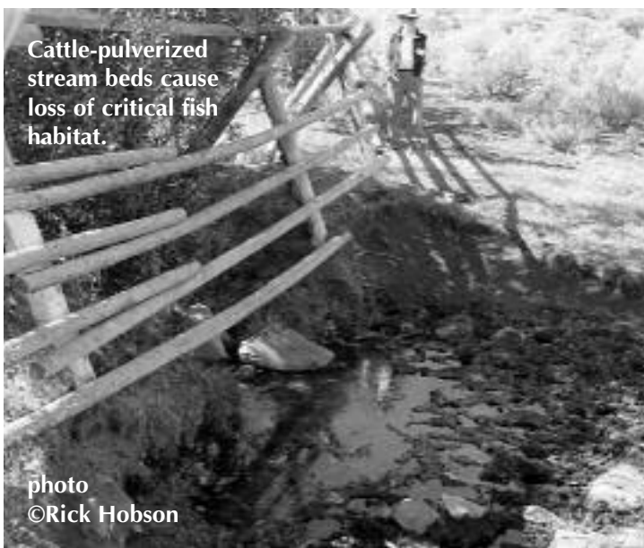
Cattle-pulverized stream beds cause loss of critical fish habitat.

Part of this scheme is “mitigation” for the environmental ravages of cyanide heap-leach gold mining. Cyanide heap-leach mining grinds up mountains and de-waters aquifers. Yes, mitigation: The mining company buys base property and the associated grazing permit, takes some measures to protect fish, and meanwhile stocks hundreds of thousands of acres of public lands to the maximum limit with cattle and sheep. The company even gets the BLM to spray sagebrush on public