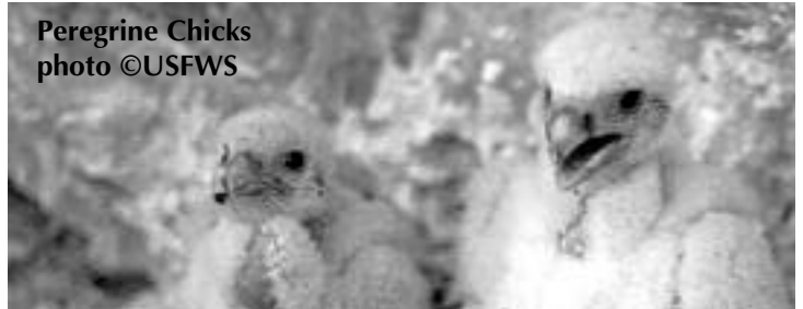
Peregrine Chicks

In 1993 and 1994 I discovered the first two peregrine territories in south-central Idaho at nearby (as the peregrine flies) Redfish and Stanley lakes. The Redfish female's red leg band indicated she had gotten her start with a little help from the Peregrine Fund. (Incredibly, biologists also observed a female with a red leg band at Redfish in 2003, likely the same individual!). At the time there were fewer than 15 known territories (30 peregrines) in Idaho.