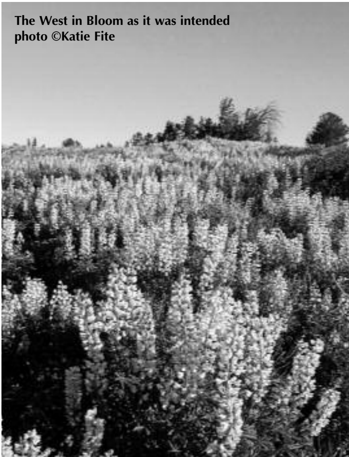
The West in Bloom as it was intended