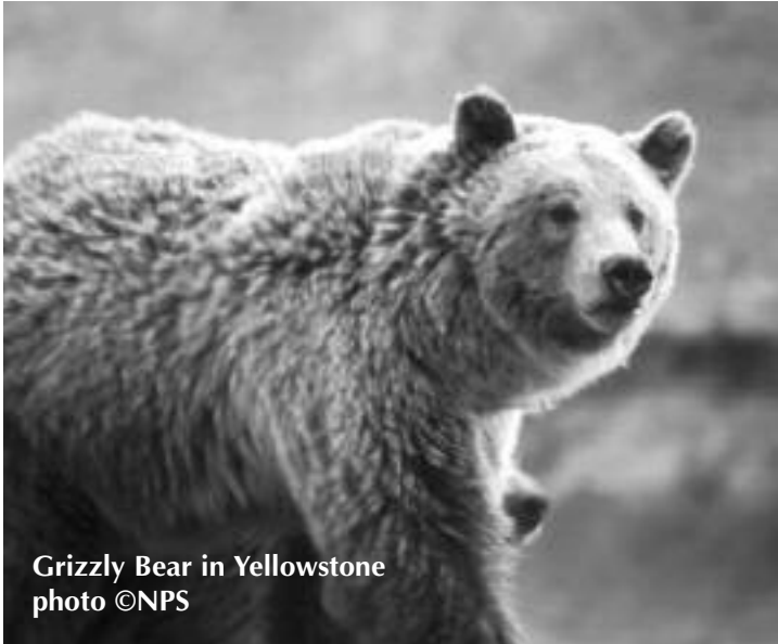
Grizzly Bear in Yellowstone

Other interests: Travel, aikido, high-altitude trekking, backpacking, philosophical discussions of all types.