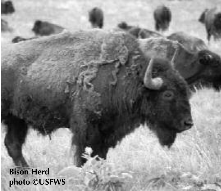
Bison Herd

The Majestic Taylor Fork is a high and scenic mountain valley of public lands draped with sagebrush-grasslands that provide headwater stream flows to the Upper Gallatin River Canyon. The U.S Forest Service currently leases two small cattle allotments on approximately 16,000 acres of public wildlands in the area to provide fodder for some 450 domestic cows for about three months in the summer.