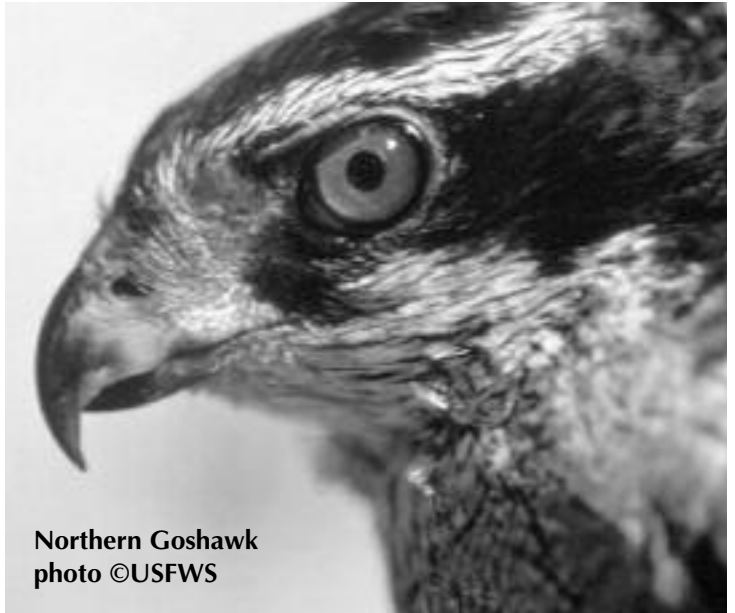
Northern Goshawk

In recent negotiations with the BLM, we were able to persuade the agency, livestock permittees and congressional representatives to agree to modify a current bill to add 10,000 acres to the proposed Cedar Mountain Wilderness in Utah and eliminate some roads that would penetrate the wilderness in the process.