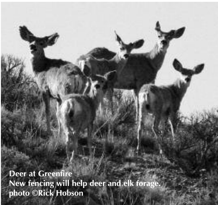
Deer at Greenfire New fencing will help deer and elk forage.