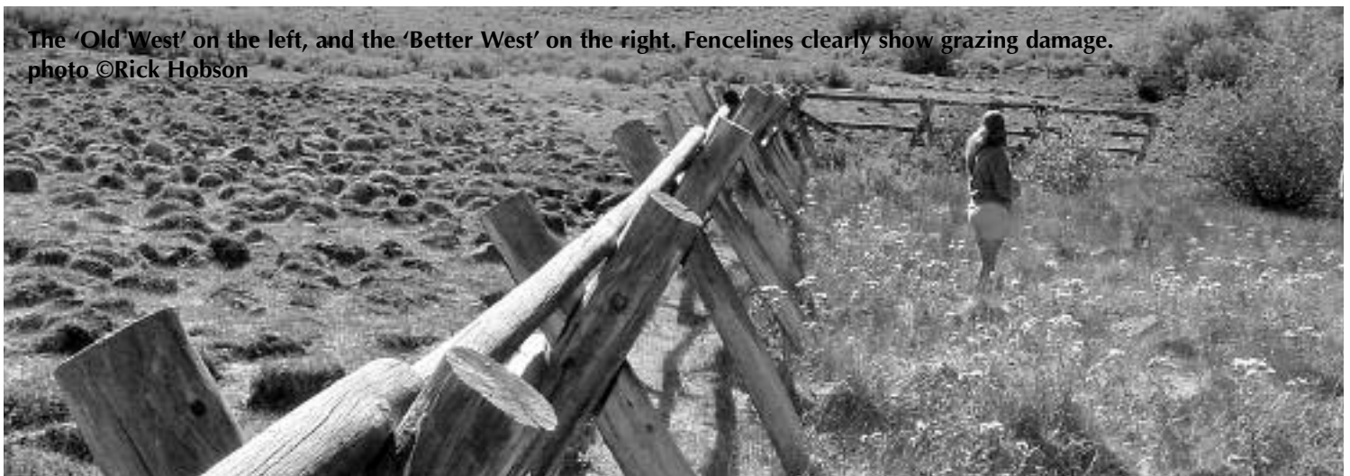
The 'Old West' on the left, and the 'Better West' on the right. Fencelines clearly show grazing damage.